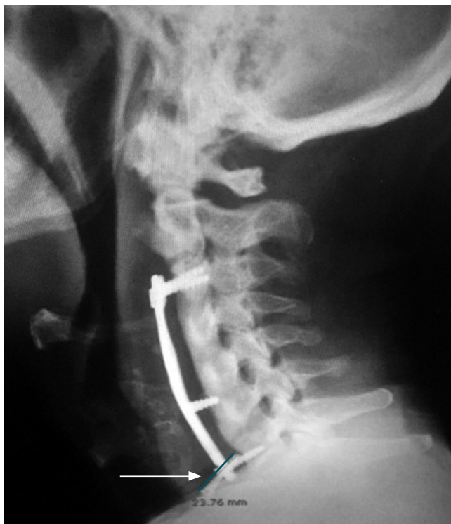
Figure 1. Lateral cervical spine radiography. Arthrodesis plate with proximal fixation at C3 and distal fixation at C7 (arrow), along with an intermediate and a displaced distal screw.

cal spine radiograph, which revealed anterior displacement of the C7 fixation screw ( Figure 1 ).