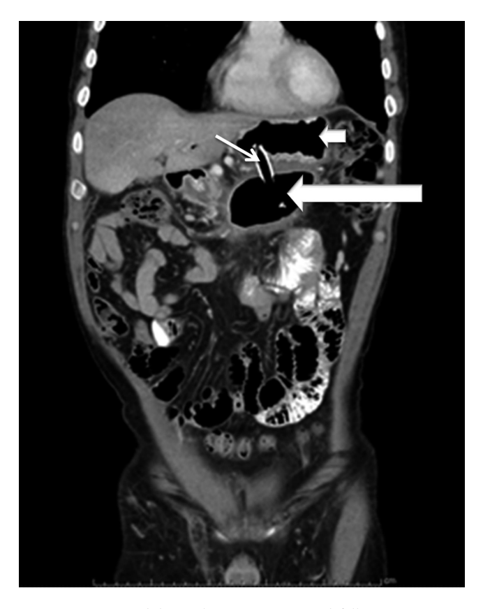
Figure 2. Contrast abdominal CT scan at one week follow-up on patient shown in Figure 1. Pancreatic pseudocyst with transmural drainage. The short arrow points to the gastric cavity, the thin arrow points to the stent between the gastric and pancreatic cavities, and the long arrow points to the cavity of the pancreatic pseudocyst.

Complications most frequently associated with this procedure are bleeding, infections, pneumoperitoneum, air embolisms and perforations, (17, 20-22) but none of these occurred in our series. The complication that presented in our series was release of a metal stent within the pseudocyst. However, no surgical procedure was required to remove it. It occurred because ultrasound guided release was not coordinated with endoscopic vision.