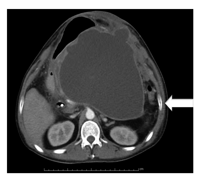
Figure 1. Abdominal CT scan with contrast. The arrow points to the pancreatic pseudocyst.

compromised the body of the pancreas. A transmural stent (cystogastrostomy) was successfully implanted in 9 patients (90%) (Figure 2). Only partially or totally covered selfexpanding metal stents were placed in six patients, but metal stents with 10 Fr double-pigtail plastic stents inside were placed in three patients. Drainage of one patient was performed by aspiration with a resolution of 95% of the lesion size since the pseudocyst was 5 cm. During the procedure