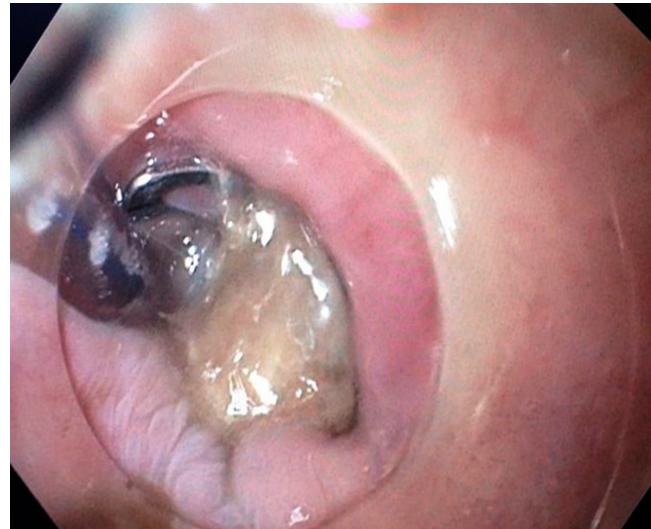
Figure 3. Endoscopic image after closing the fistula with the Ovesco clip.