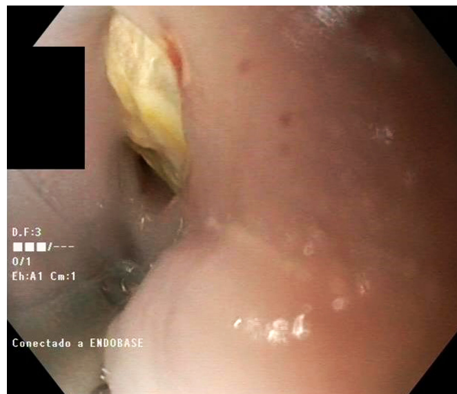
Figure 1. Endoscopic image of the esophageal fistula.

An upper gastrointestinal (GI) endoscopy was performed, finding a 0.8 cm whitish-to-yellow and whitish esophageal lesion was observed at about 29 centimeters from the dental arch. It did not seem to originate in the esophageal mucosa as it moved independently ( Figure 1 ), suggesting the presence of an esophageal fistula. A computed tomography (CT) scan was performed, confirming the diagnosis of bronchoesophageal fistula associated with mediastinal mass ( Figure 2 ). A subsequent bronchoscopy showed an obliterative and necrotic endobronchial mass with malignant pseudomembranes.