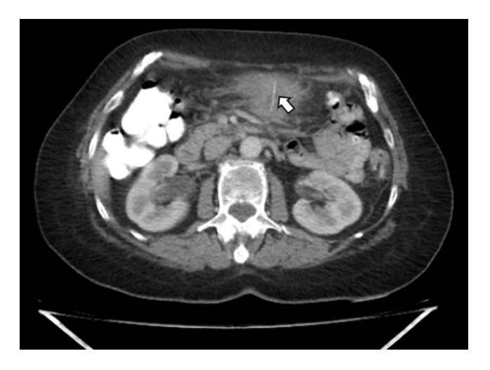
Figure 1. Contrast enhanced abdominal CT scan.

Tumor markers were negative; leukocytosis and anemia were not reported in the complete blood count test, and the patient had elevated CRP levels (172.9).