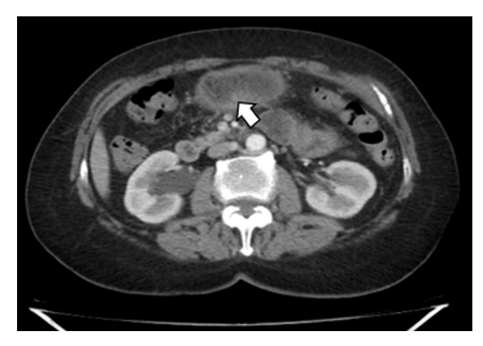
Figure 4. Control contrast enhanced abdominal CT scan.

The highest percentage of gastrointestinal perforations caused by fish bones occurs in the esophagus (approximately 50 % of cases); despite this, aortic rupture is a rare complication. Benítez (11) reported two aortic rupture cases in which the patients died due to an aortoesophageal fistula, which reaches 22%; this is why making a timely diagnosis and identifying the location of the lesion is important, as this will contribute to improving the prognosis of these patients. Only 26% of ingested foreign bodies remain impacted in the gastric mucosa, and more frequently they can lead to complications such as abscesses, perforation and fistulas (4, 6, 7, 10). In children, ingested foreign bodies are usually located in the airway; besides, according to the location of the foreign body, symptoms may range from cough until respiratory distress. In these cases, bronchoscopy is indicated as it is a diagnostic, therapeutic, and safe procedure; this way, bronchoscopy has become the gold standard to extract foreign bodies in children, and delaying this procedure could increase the risk of complications (12-14).