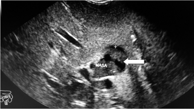
Figure 1. The arrow shows an anechoic image without acoustic shadowing within the intrahepatic bile duct that suggestive of a mass, but as it moves it appears to correspond to mucus in the bile duct. This was confirmed later.