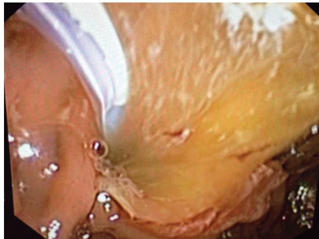
Figure 3. The balloon is seen at the top. At the bottom abundant mucus is removed with the balloon.