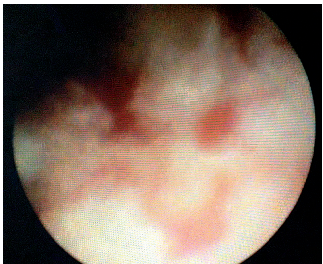
Figure 4. The image on the left shows a smooth, pearly, normal appearing bile duct wall (thin arrow) in the upper part of the mucus that has filled the common bile duct. The image on the right shows the wall of the bile duct with irregular hematologic points compatible with the mucus-producing papillae that characterize this tumor. Spybite was used to take a biopsy sample which tested positive for IPMN.