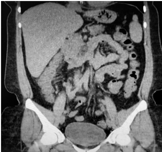
Figure 2. Endoscopic findings. Edema, erythema, loss of vascular pattern, and ulcerations covered by fibrin.

Based on the patient's symptoms and endoscopic findings, a diagnosis of severe ulcerative colitis was made, and treatment with intravenous corticosteroids, oral 5-aminosalicylic acid (5-ASA in granules), and enemas was initiated. The pathology report indicated that the patient had inflammatory bowel disease suggestive of severe ulcerative colitis without dysplasia or metaplasia. The patient's infectious profile showed only positive results for CMV IgG, normal liver function, and a fecal calprotectin level above 1000 ng/mL. Fortunately, the patient responded well to