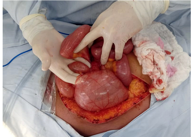
Figure 3. Surgeon's finger passes through the hiatus of the Landzert fossa, where intestinal loops come out.