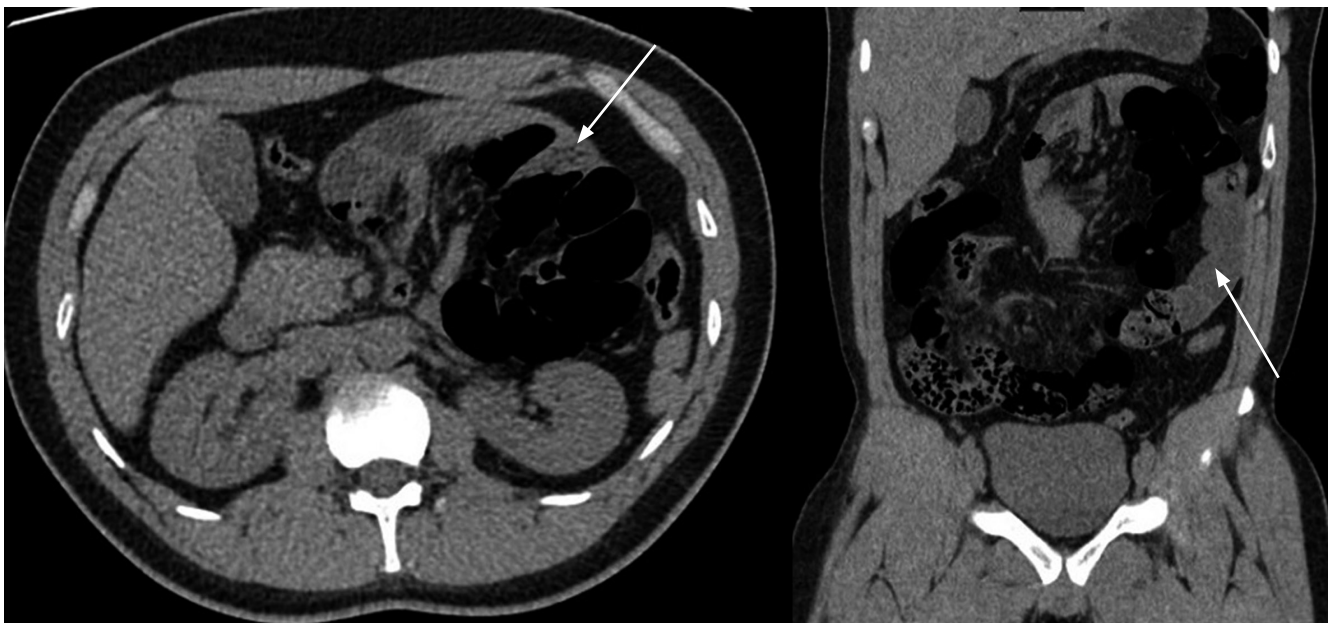
Figure 1. UroCT shows an axial and coronal section, respectively. The arrows point to the conglomerate of intestinal loops in the left hemiabdomen.

PH occurs when there is some failure in the rotation of the prearterial portion of the small intestine when interposing in the fusion of the colon (postarterial) with the