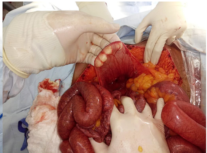
Figure 4. Hernial sac, before and after resection.

retroperitoneum, which creates the fosses where the hernia occurs: the Landzert fossa to the left of the SMA, with 75% frequency, and the Waldeyer fossa on the right side, with a 25% frequency. (3,7,8)