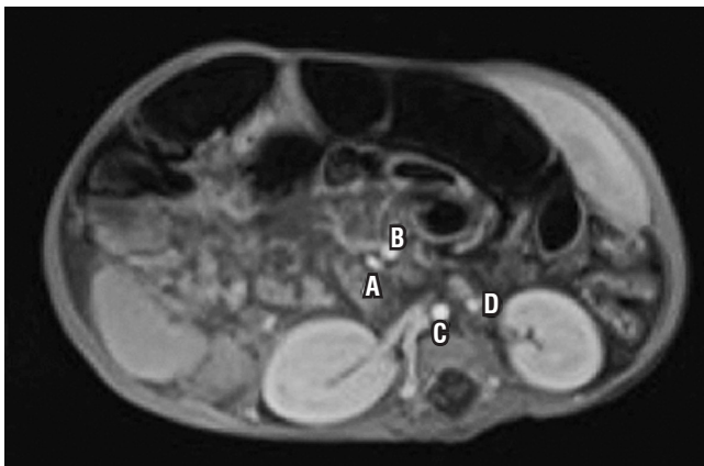
Figure 1. The upper mesenteric artery can be seen at the right (A) and the upper mesenteric vein can be seen at the left (B), similarly, the normal positions of the aorta (C) and the inferior vena cava (which is seen on the left) (D) are reversed.

Hb: Hemoglobin (mg/dl), Htc: Hematocrit (%), N%: percentage of neutrophils, TB: Total bilirubin (mg/dl), DB: Direct bilirubin, ALP: alkaline-phosphatase (U/L), GGT: gamma-glutamyl transpeptidase (U/L), ALT: alanine amino transferase (U/L), AST: aspartate aminotransferase (U/L) PT: prothrombin time (seconds), PPT: thromboplastin time (seconds), ALB: albumin (g/dl), BUN: blood urea nitrogen, Cr: creatinine (mg/dl).